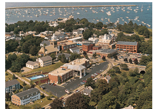
John Carver Inn in historic Plymouth